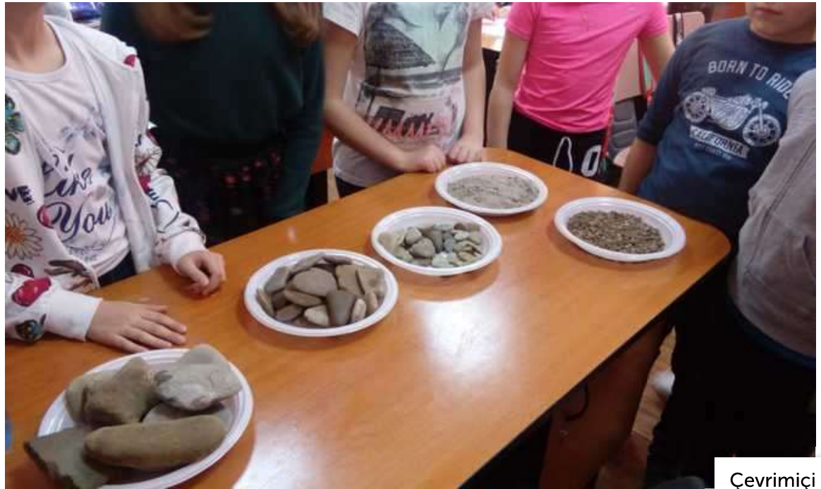
Çevrimiçi üyeler (1)