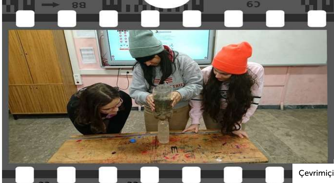
Çevrimiçi üyeler (1)